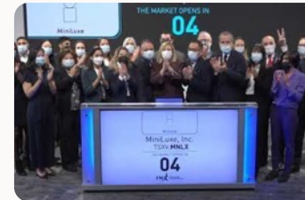
December Canadian TSX raise of $20M (Largest in Canadian CPC)