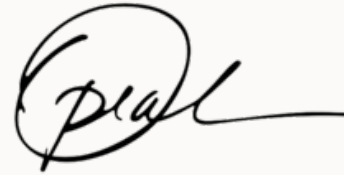
Oprah's Favorite Things 2019 "Tesla of Nail Polishes"