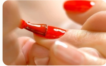
No more acrylics