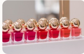
No other Brands only proprietary clean Brand