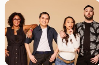
All 5-year nail designers get equity in the company