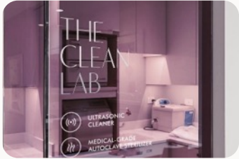
Intro of autoclaving in all services